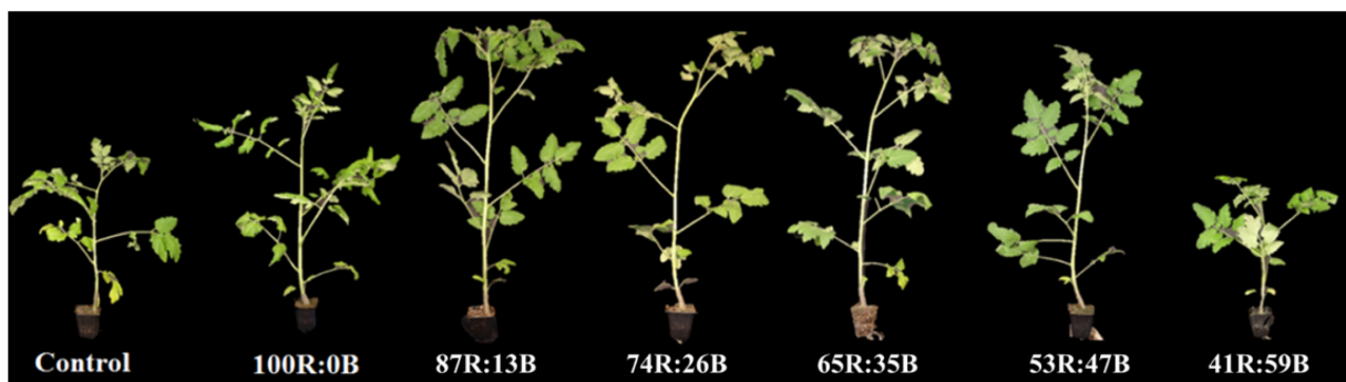
Fig. 2. Number of node (A), internode length (B), stem length (C), stem diameter (D) of cherry tomato seedlings grown under various combined ratios of red to blue LEDs and a picture of cherry tomato seedlings at 27 days of LED treatment (E) ( p < 0.05 ).